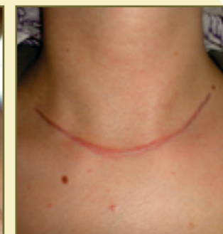
Hypertrophied scar of open thyroid surgery