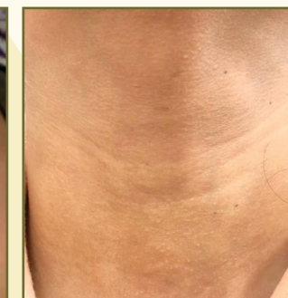
Scarless Thyroid Surgery