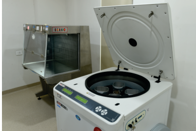
Platelet Rich Plasma Harvester