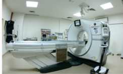
Dual energy 256 slice CT Scanner