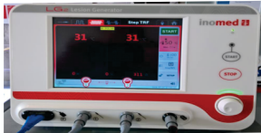
RF Lesion generator