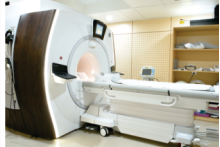
Most advanced 3.0T MRI